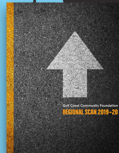
Regional Scan 2019

Our priorities are your priorities. Gulf Coast is committed to action across the range of issues facing our communities, and we are ready to lead, partner, and invest in innovative ideas and solutions. We invite you to join us in transforming our region.